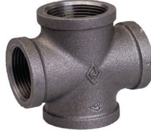
180 Crosses - Black