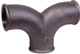
132 Twin Elbows - Black