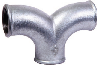
132 Twin Elbows - Galvanised